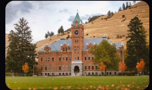
University of Manchester

Interactive learning sessions about personal journeys, emotional intelligence, and resilience in the serene Lake District.